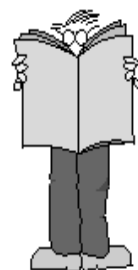
Photo Essay Picture Dictionary Picture Story for Children Poem Poster Pottery Prototype Puppet Puppet Show Radio Show Relief map Sand-casting Scrapbook Sculpture Silk-screening Skit Slide/Tape Presentation Small Scale Drawing Song Sonnet Stencil Stitchery Survey Terrarium Time Line Travel Brochure Travelogue TV Documentary TV Newscast Video Game Watercolor Painting Write a New Law

Guest speaker Haiku Interview Illustrated Story Journal Labeled Diagram Large Scale Drawing Lecture Letter Letter to the Editor Lesson Limerick Line Drawing Magazine Article Map with Legend Maze Mobile Model Montage Movie Mural Museum Exhibit Musical Composition News Report News Article News Paper Page Novella Oil Painting Package for a Product Pamphlet Pantomime Pattern with Instructions